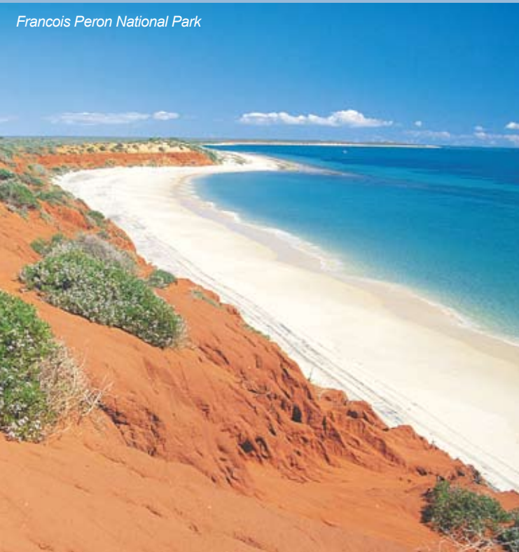
Francois Peron National Park

Legend: (B) Breakfast (BL) Boxed lunch (PL) Picnic lunch (D) Dinner