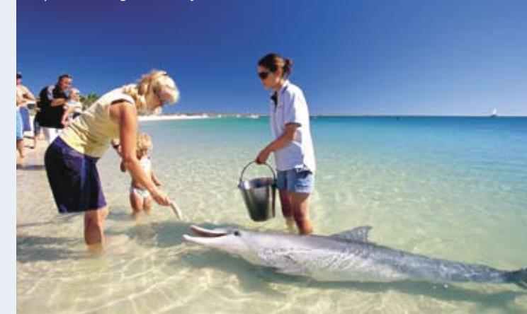
Dolphin Feeding at Monkey Mia

lunch at the site of the first recorded (and documented) European landing on the Australian continent, and reflect on this most historic moment. After a fascinating visit, we make our way overland and by sea to our accommodation in Denham. Dinner will be at the hotel. (B/PL/D)